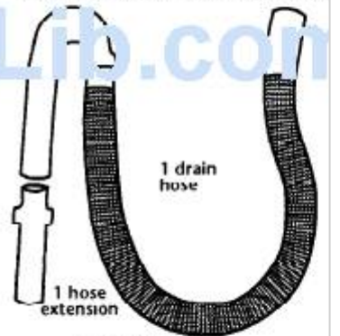
1 drain hose