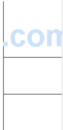
Fig. 7 SM830082